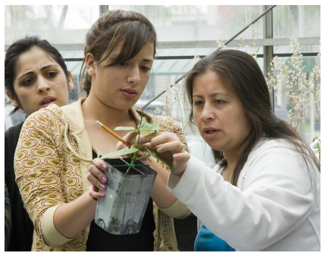
California State University, Los Angeles

Do students and faculty members work together on committees and projects outside of course work? 39% of FY students at least occasionally spent time with faculty members on activities other than coursework.